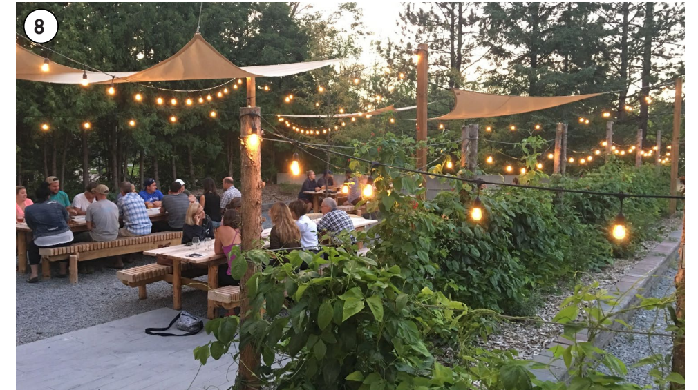
Atlanta Beer Garden