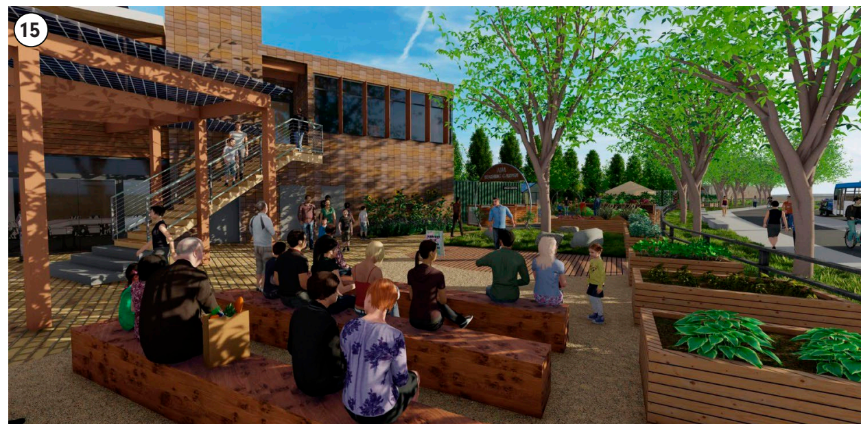
Credit: Agricultural Institute of Marin – The Center for Food & Agriculture (for illustrative purposes only) | Multistudio + April Philips Design Works