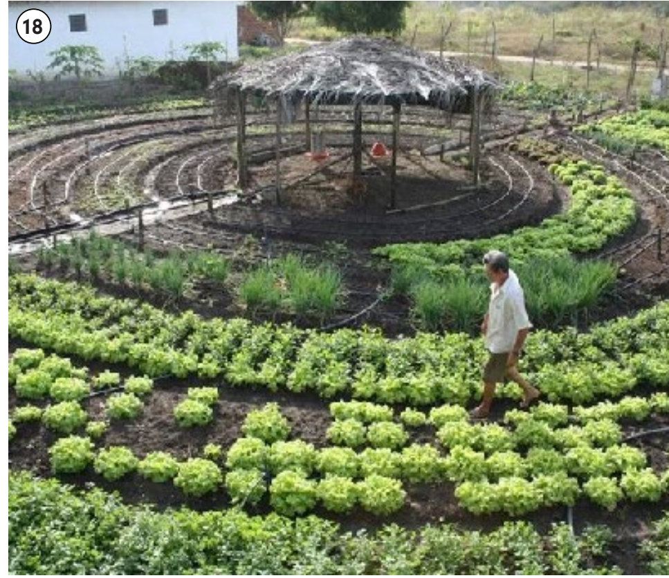
agroforestry