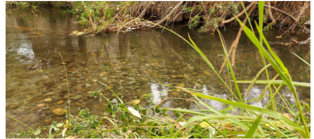
SBCCC Habitat Restoration Site (Gravel Augmentation Project)

This project is designed to increase the scale and pace of ecological restoration in the Los Gatos Creek Watershed. North Santa Clara RCD (Formerly GCRCD), through a core partnership with San Jose Water (SJW), and South Bay Clean Creeks Coalition (SBCCC), is using funding to support restoration of streams, floodplains, and tributaries of the Los Gatos Creek Watershed.